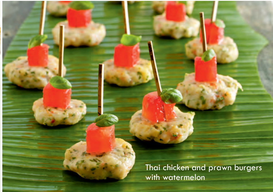
Thai chicken and prawn burgers with watermelon