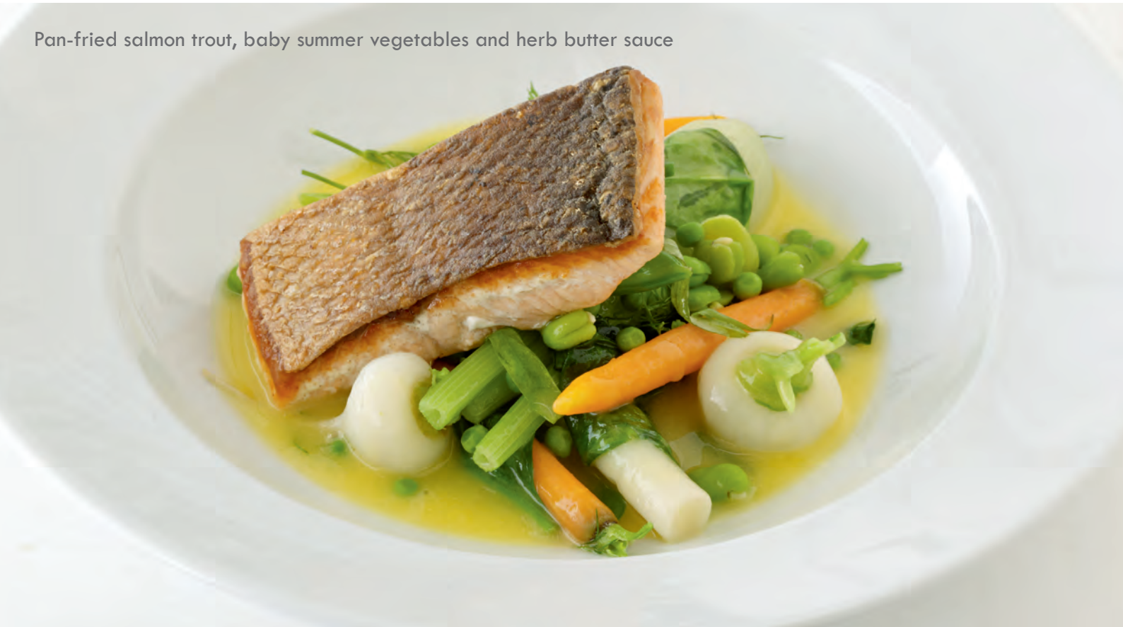
Pan-fried salmon trout, baby summer vegetables and herb butter sauce

• CREATIVE FOOD • DISTINCTIVE EVENTS • EXCEPTIONAL SERVICE •