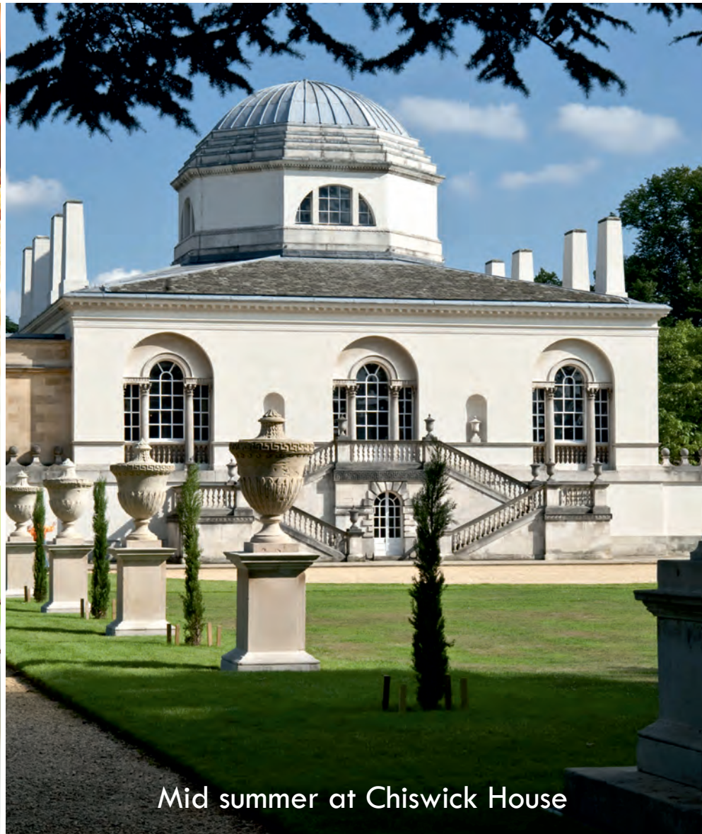
Mid summer at Chiswick House