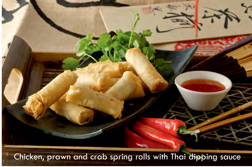
Chicken, prawn and crab spring rolls with Thai dipping sauce