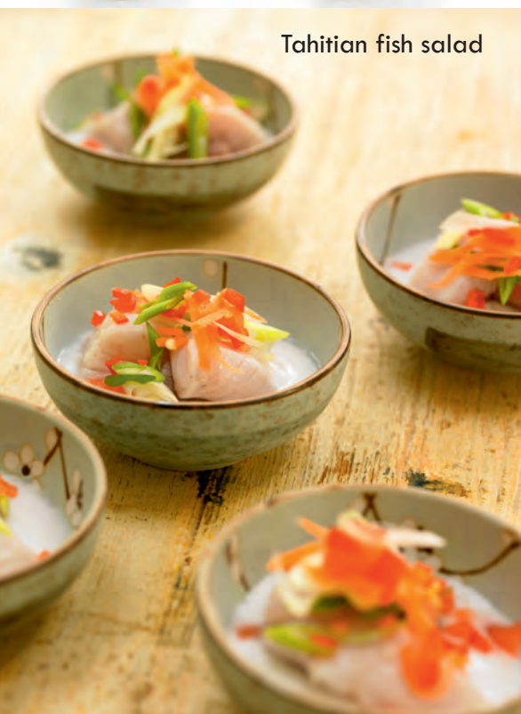
Tahitian fish salad