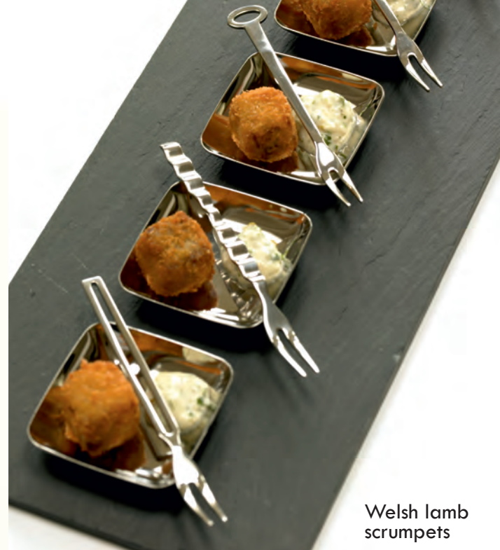
Welsh lamb scrumpets