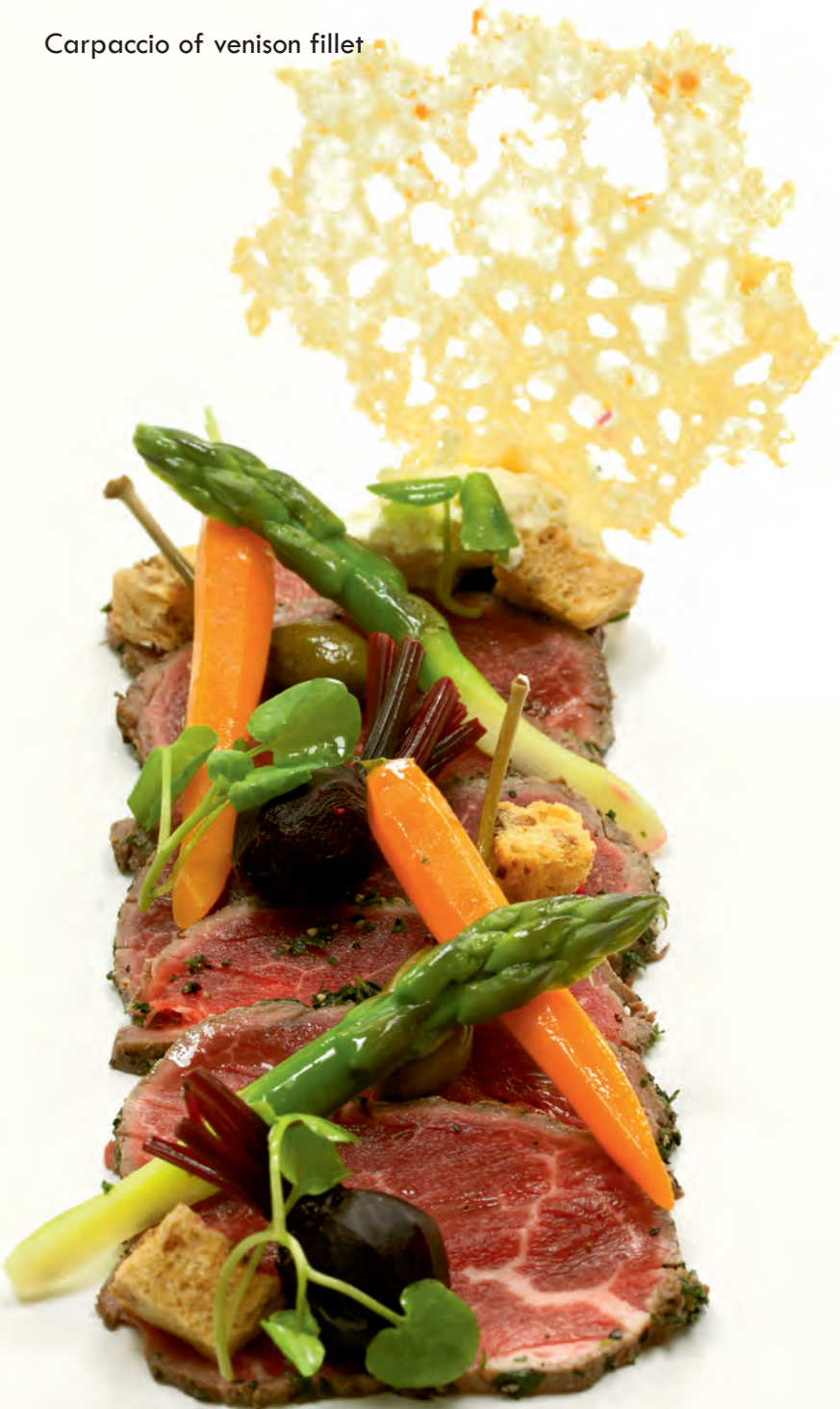
Carpaccio of venison fillet